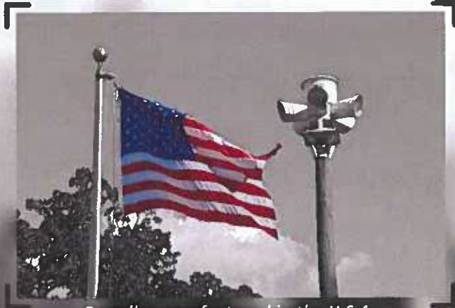
Proudly manufactured in the U.S.A.