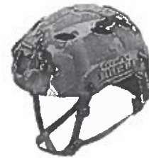
AOUTACC Lightweight... 169