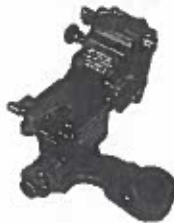
Gexmil PVS 14 J Arm... 53