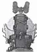
KRYDEX Tactical Helme... 1,517