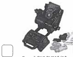
Gexmil CNC PVS15/18... 456